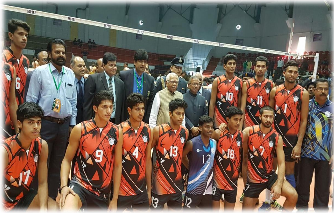
Hon'ble. Shri. Ram Naik ji, Governor of Uttar Pradesh along with other dignitaries with Indian Universities team during the opening match