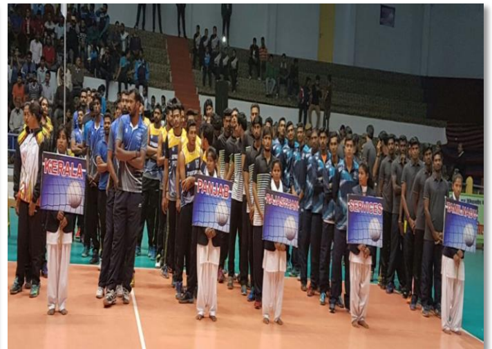
Teams line up during the opening ceremony