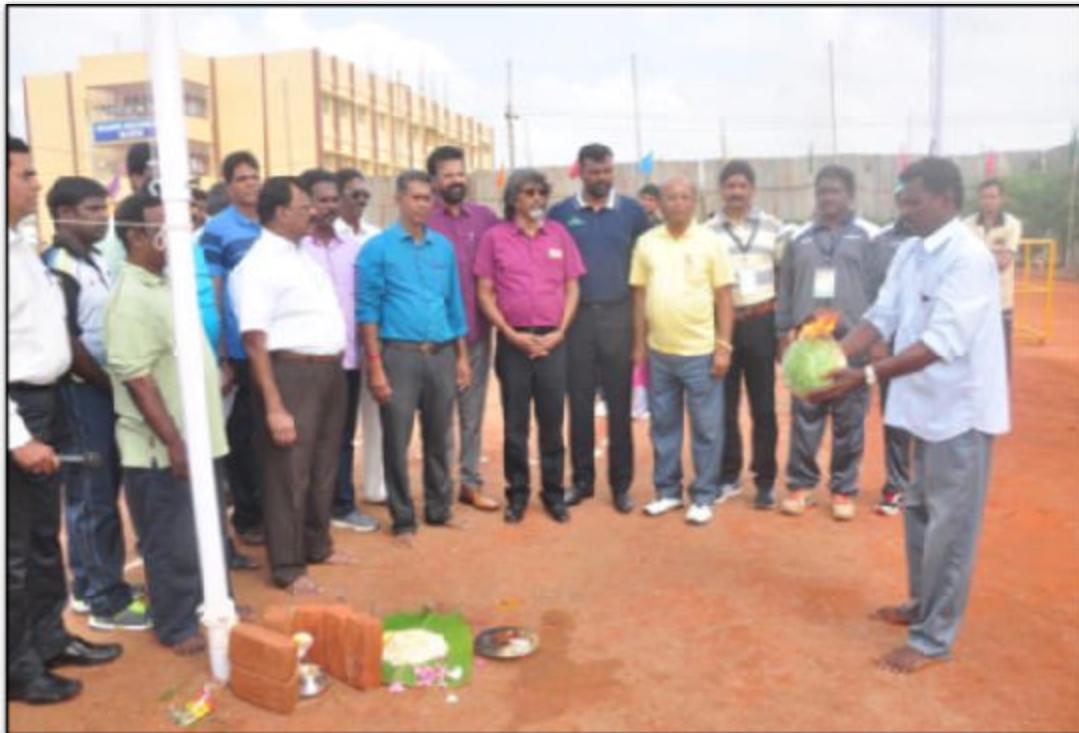
Pooja before inauguration of the championship