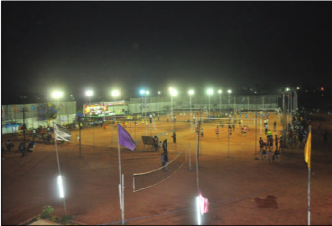
A beautiful view of the Playing Courts from Higher End