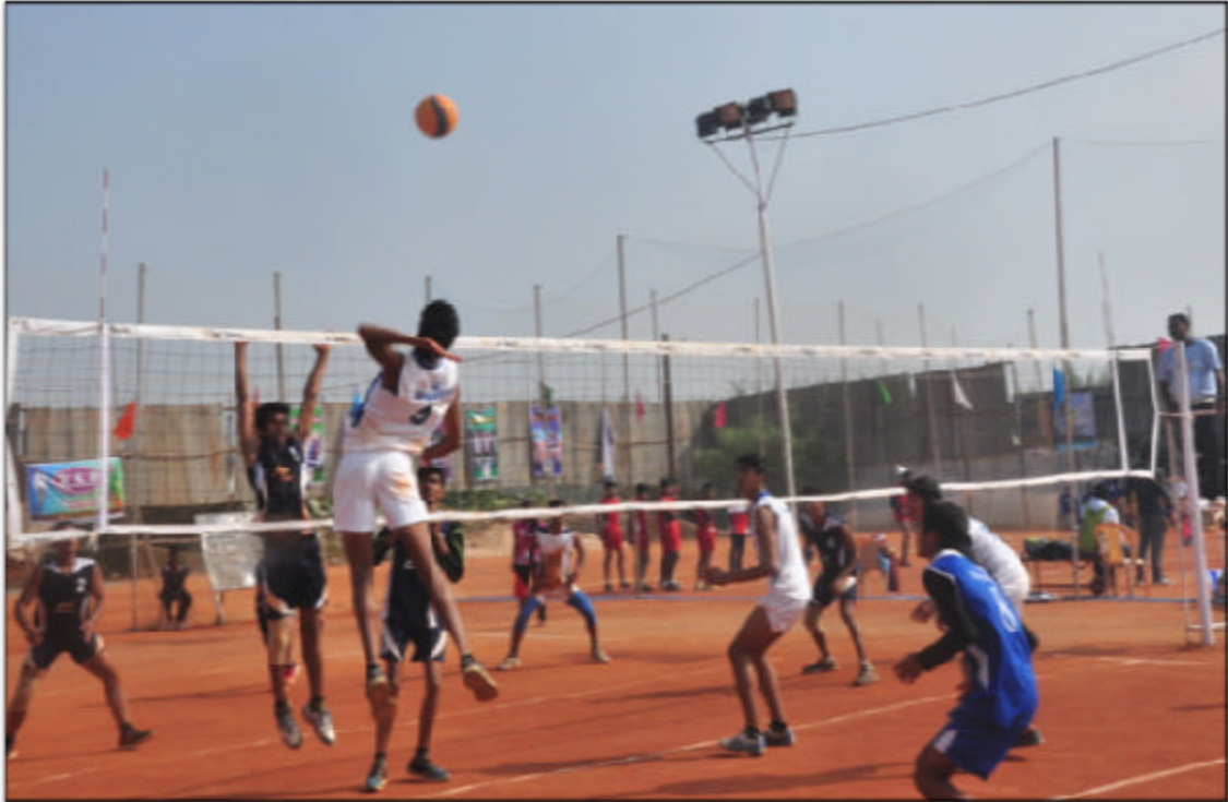
An action between match of Delhi and Himachal Pradesh