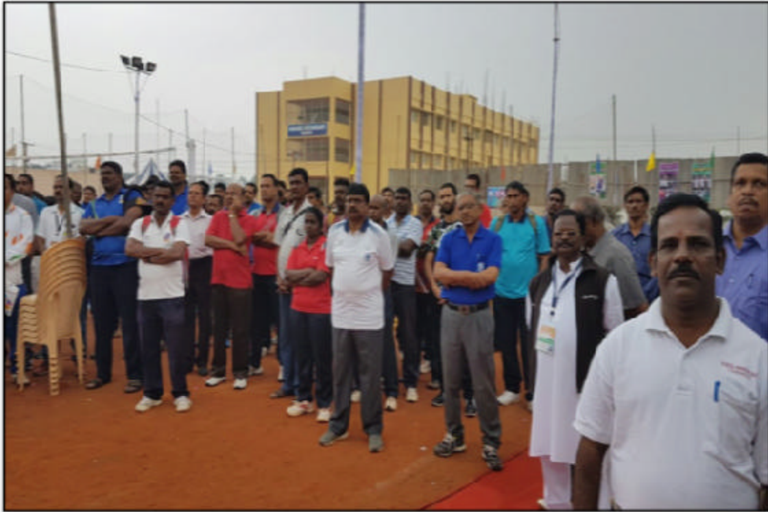
Officials gathered and ready for Flag hoisting on the occasion of Republic Day